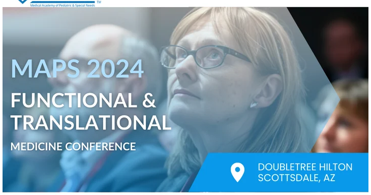
STAY AT THE GORGEOUS DOUBLE TREE HILTON